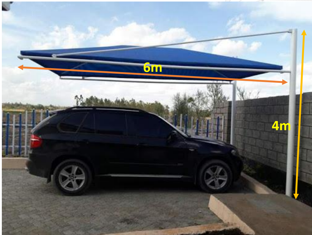
Figure 1: A car parking with steel frame (6m (L) X 3m (w) X 3m (H))